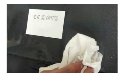
Use Water to neutralise the fluid before removing the stencil